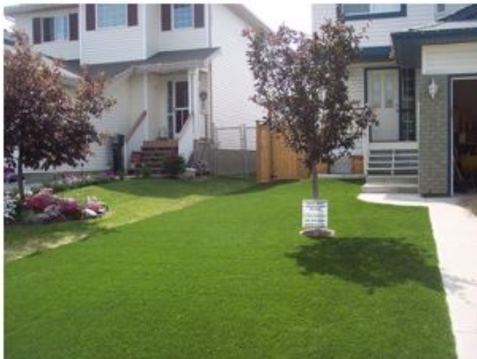
Incorrect – There should be a distinct boarder installed between the artificial turf and the neighboring natural sod.