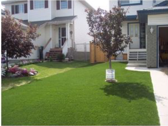
Incorrect – There should be a distinct boarder installed between the artificial turf and the neighboring natural sod.