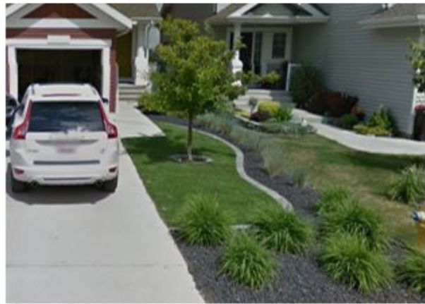
Correct – A distinct boarder containing additional shrubs has been installed between the artificial turf and neighboring sod.

Homeowners must provide a quote/invoice, to verify the specifications have been met, as a visual inspection may not suffice. Quotes/invoices may be submitted to your builder upon requesting your final inspection.