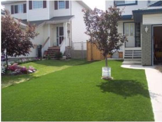
Incorrect – There should be a distinct boarder installed between the artificial turf and the neighboring natural sod.